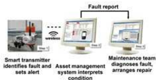
Figure 3. Reporting maintenance alerts and arranging repairs

manage a central configuration database. They can modify the instrument's parameter configuration without having to expose wiring or connect test leads in hazardous environments.