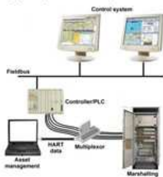
Figure 1. Hard wiring HART-capable field instruments to asset management system

About 30 million HART-capable 4-20 mA instruments serve as physical plant assets that perform measurement and control