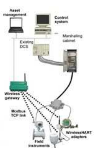
Figure 2. Employing WirelessHART adapters to communicate with asset management

Plants can add a wired HART multiplexor. A serial link from the multiplexor to the host asset management system would provide access to the instrument HART data. The logical location for the multiplexor in making this series connection to the 4-20 mA signal is the marshalling cabinet. Here installation technicians could connect each instrument signal in turn to the